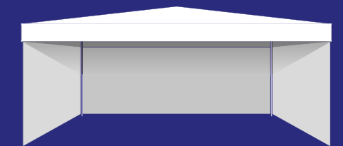
SMALL SHADED STALL