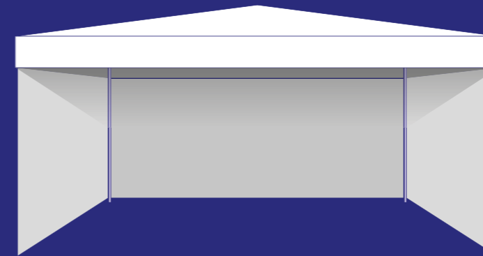
LARGE STALL - RECTANGLE