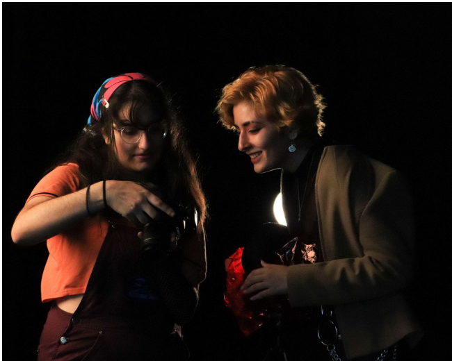
Some 'behind the scenes' images from both shoots: